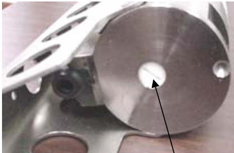
Standard pressure sensor port plug

At Sea-Bird, a pressure port plug with a small (0.042-inch diameter) vent hole in the center is inserted in the pressure sensor port. The vent hole allows hydrostatic pressure to be transmitted to the pressure sensor inside the instrument.