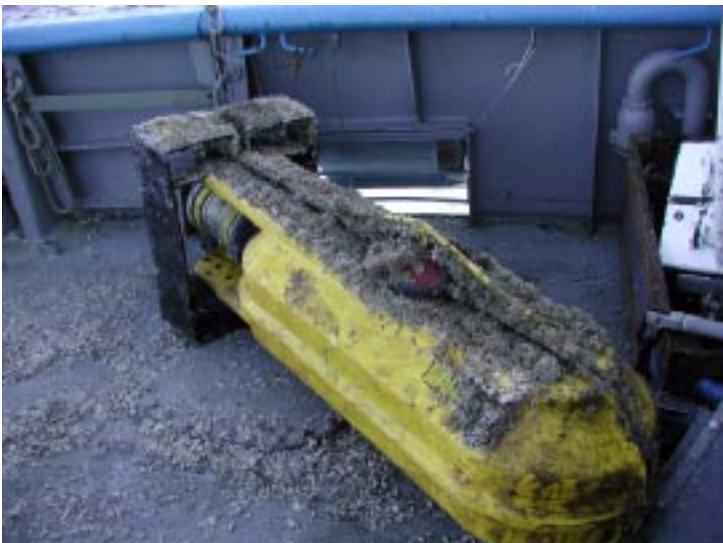
ADCP from A4-02