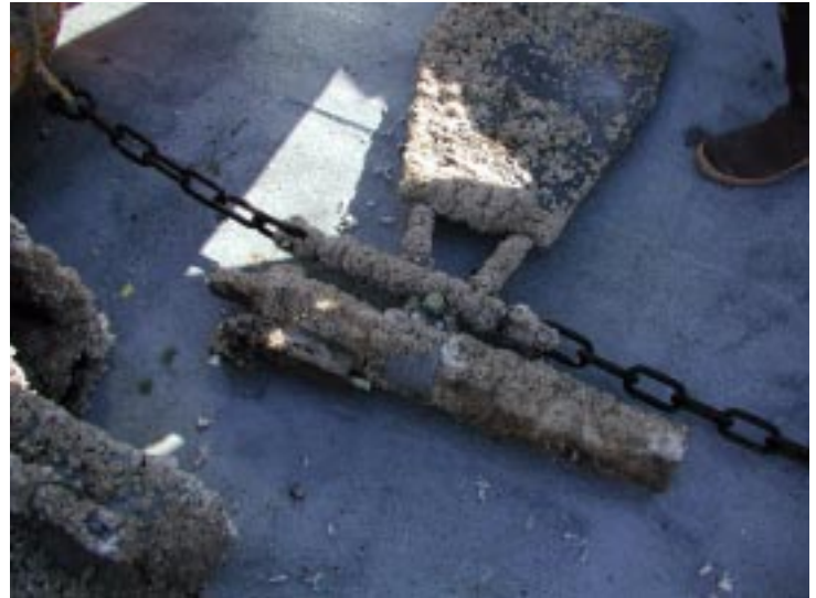
SBE from A4-02